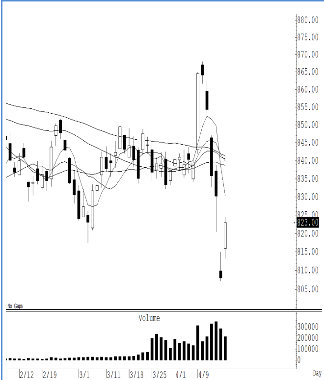
S50M24 (Close 823.00 Chg 14.90)